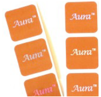
The Aura Patches are flexible.

The physical body is able to choose the frequency needed to maintain its balance. Instead of putting a substance into the body, i.e. drug or supplement, this technology provides the frequency signature of the substance that is needed by the body to create and maintain balance that achieves health benefits.